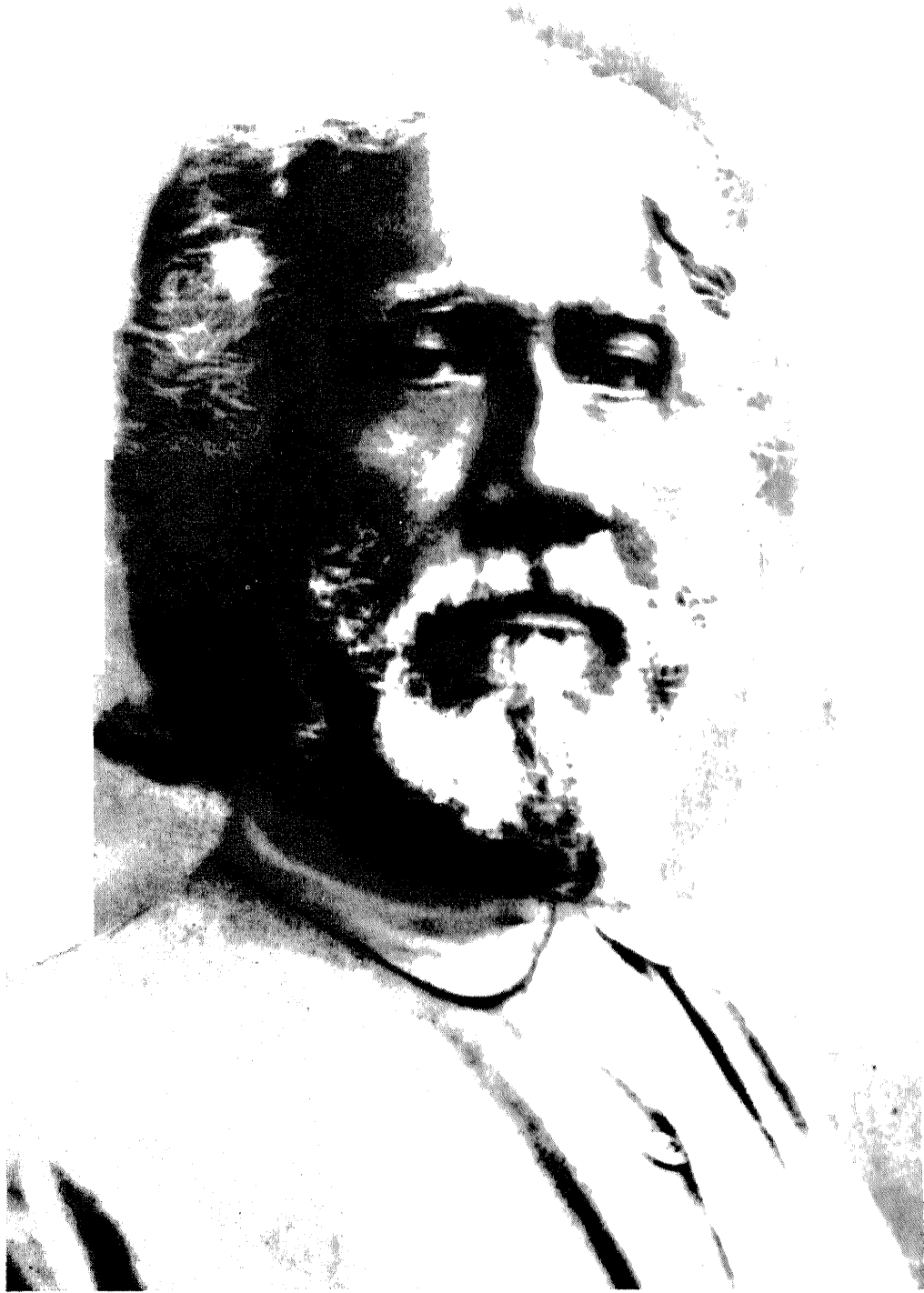
SRI SRI SWAMI SRI YUKTESWAR GIRI