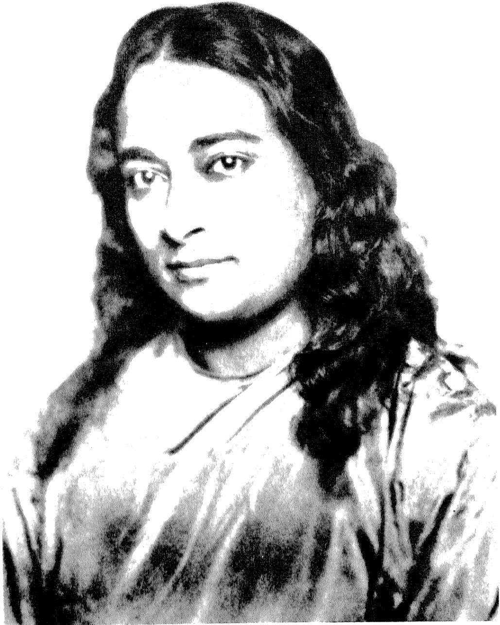
SRI SRI PARAMAHANSA YOGANANDA