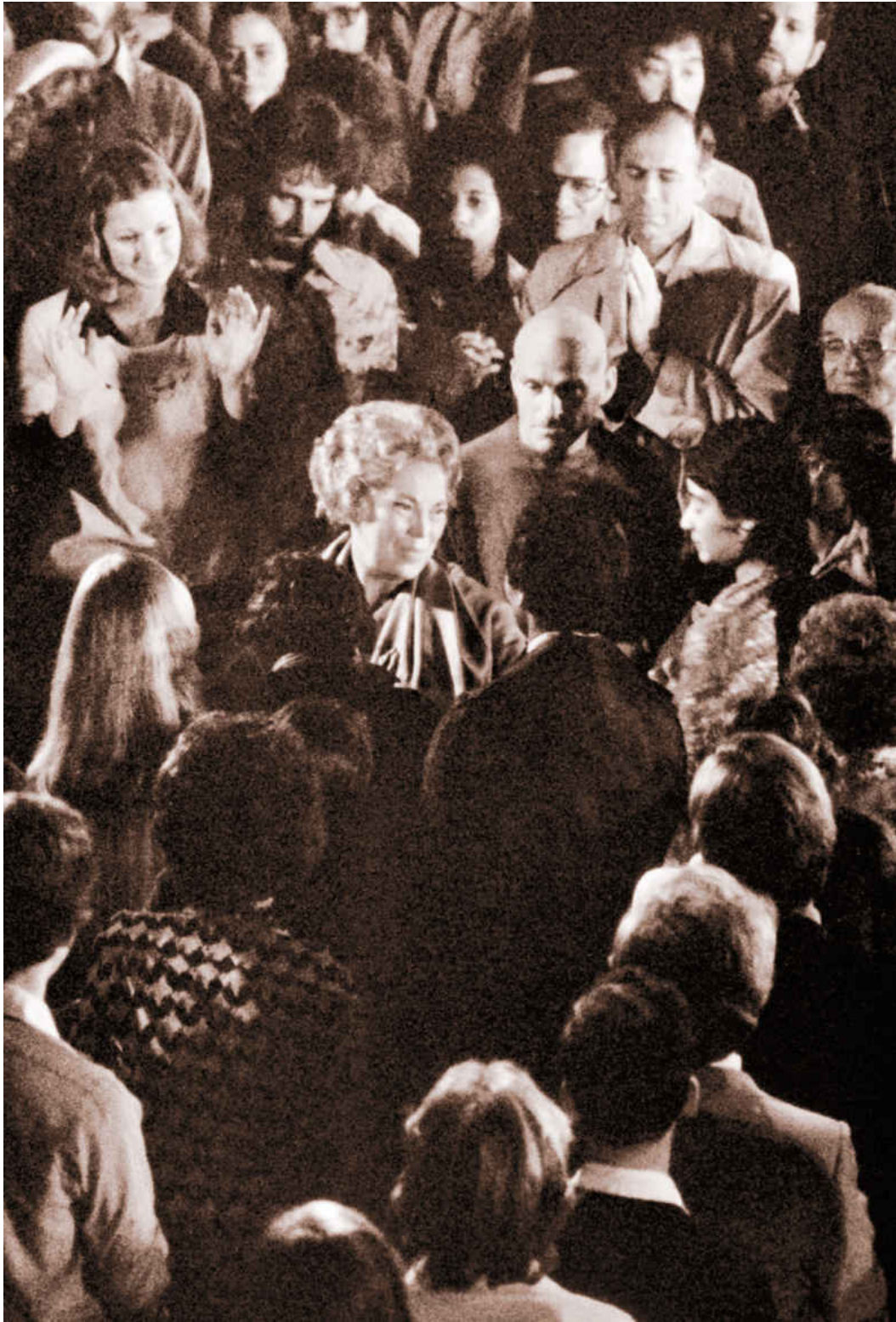
After Christmas satsanga , Pasadena Civic Auditorium, 1978