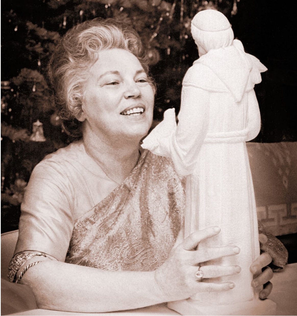
With statue of St. Francis of Assisi received as Christmas gift, December 25, 1973