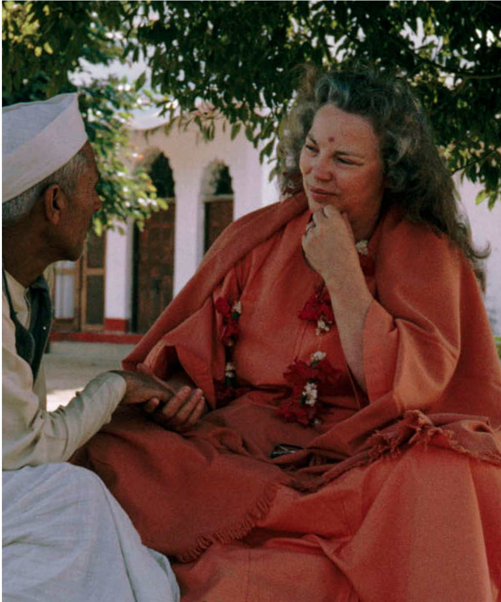
Greeting devotees after satsanga at YSS Ashram, Ranchi, 1967