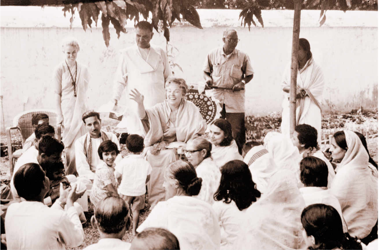
Following satsanga at Ranchi, 1968, Mataji playfully tosses wrapped candies to the assemblage

“Anyone who deeply loves God finds it very difficult to be solemn all the time. There is always a divine joy bubbling up from within.”