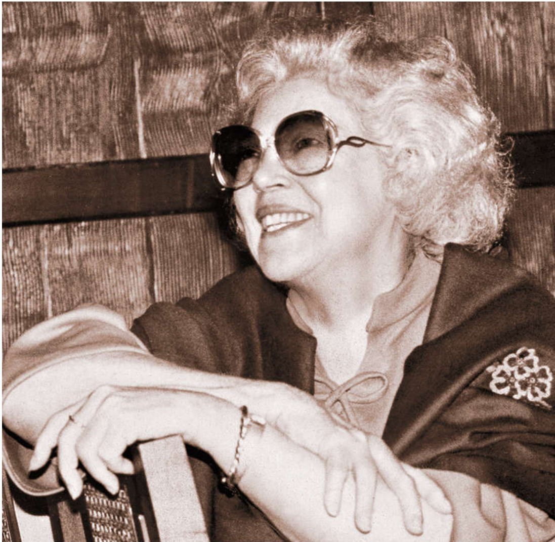
At SRF Lake Shrine, 1988

“If we consciously look for the best in every situation, that positive spirit and enthusiasm acts as a wonderful stimulant to the mind and feelings, and to the body. Right attitude is a tremendous help in removing the mental and emotional obstructions that cut us off from the divine resources within us.”