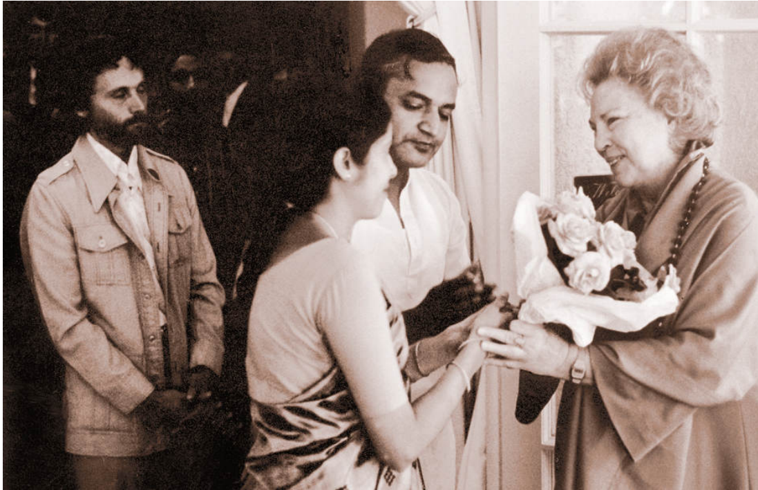
At SRF Mother Center, Los Angeles, 1982

“The way to receive love is to give love. Yet how few in this world know how to love sincerely, deeply. By meditation, as we learn to love God more and to feel His love, it becomes possible for us to love, even without asking anything in return.”