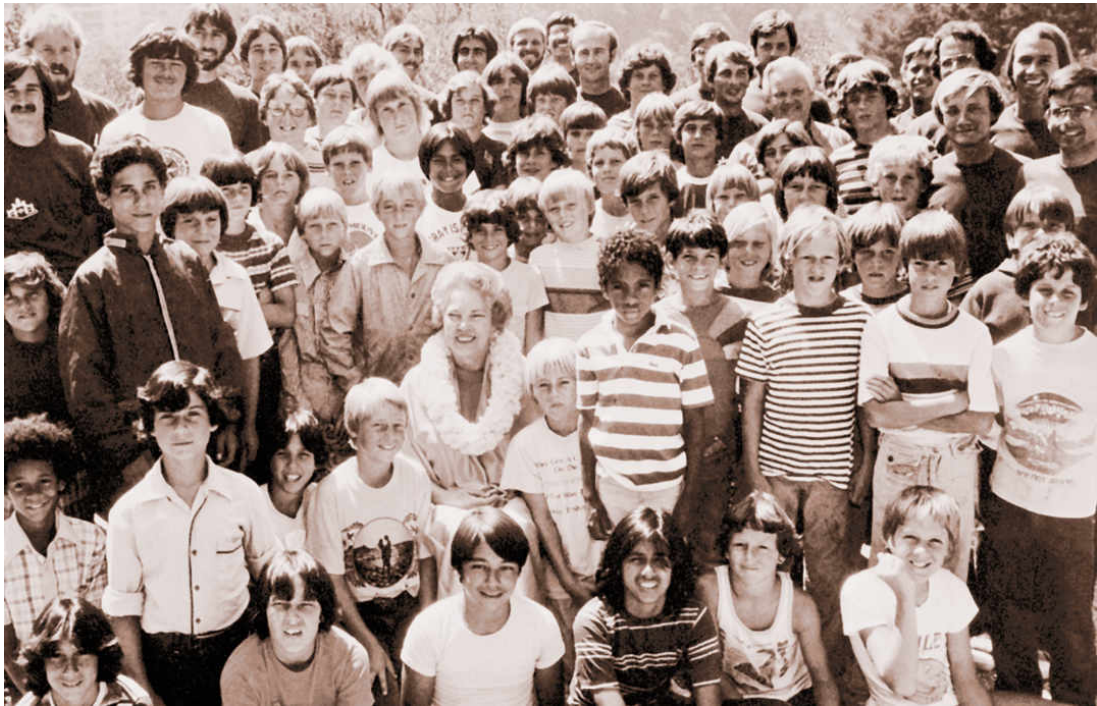
With participants in SRF How-to-Live Summer Youth Program for boys, SRF Lake Shrine, 1978

“Children are like tender plants. To grow properly, to blossom into their full potential, they need nurturing....Provide them with the right ex-ample and sense of direction that they learn to love God, to accept and carry responsibilities, to be unselfish, to be kind to others — the aggre-gate of qualities and virtues that is the measure of a spiritual-minded human being.”