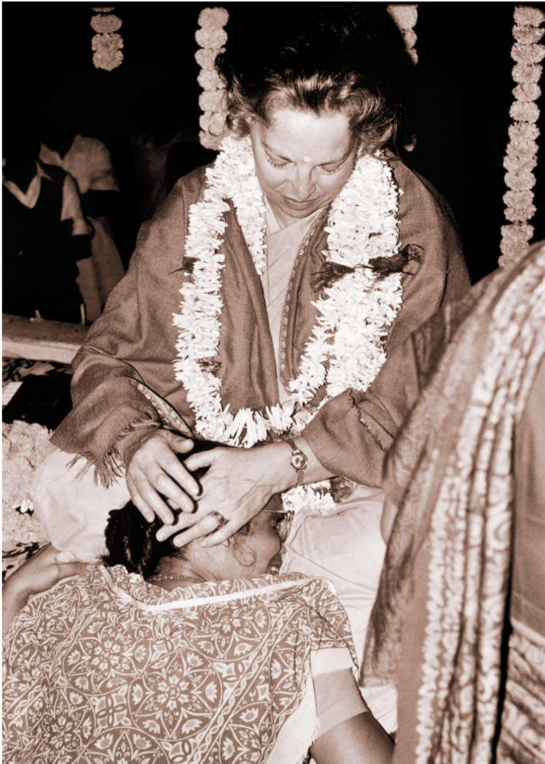
After satsanga in Delhi, 1972

“Give of your heart, give of your understanding...When someone comes to you depressed,