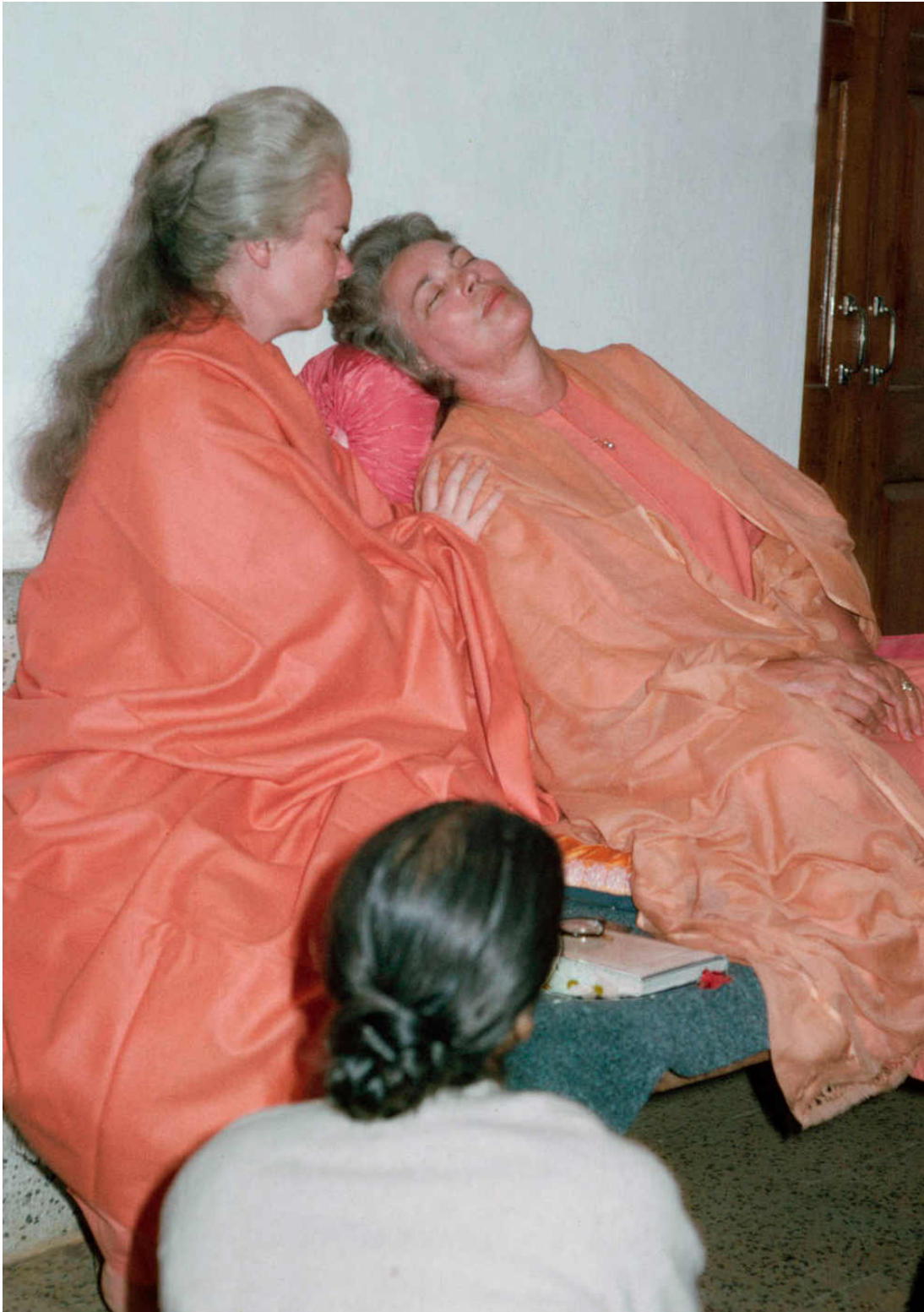
In a deep state of samadhi , wherein the consciousness has withdrawn from awareness of the body in