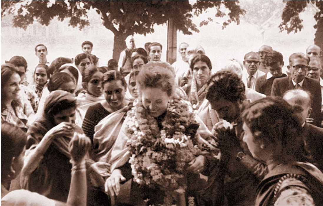
Reception by YSS members, Delhi, November 1972

“Whatever our faith or nationality, we are all kin, with one common Father. Think of others in these terms: They are my own. They are a part of my God. In each one my God is manifest. Let me serve them to the best of my ability.”