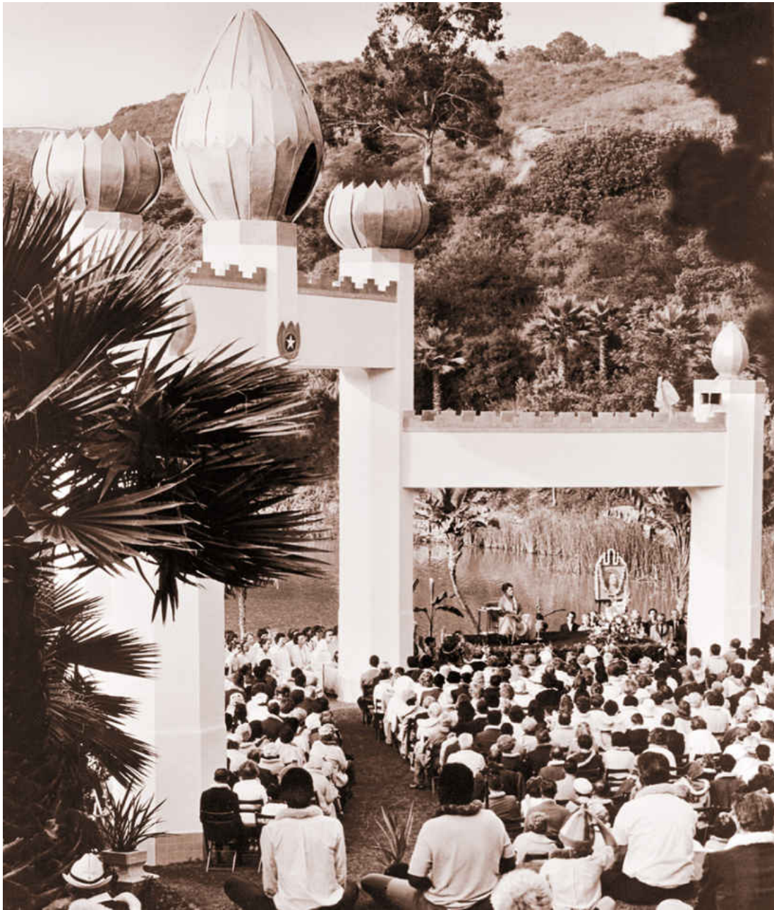
Mataji speaking at SRF Lake Shrine, July 1965