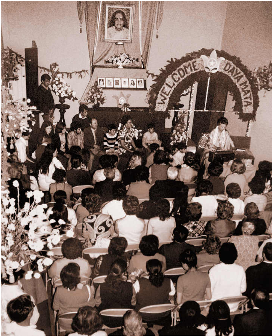
Leading devotional chanting during satsanga at Self-Realization Center in Mexico City, February 1972