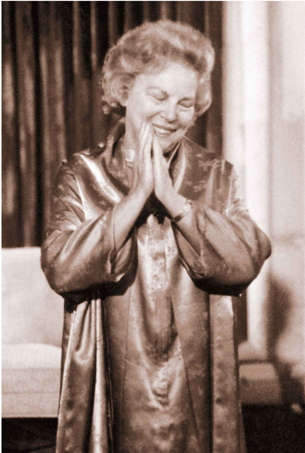
A loving benediction, Self-Realization Convocation, 1983

“The only meaning of life is to love God; that is the sole reason for which man was