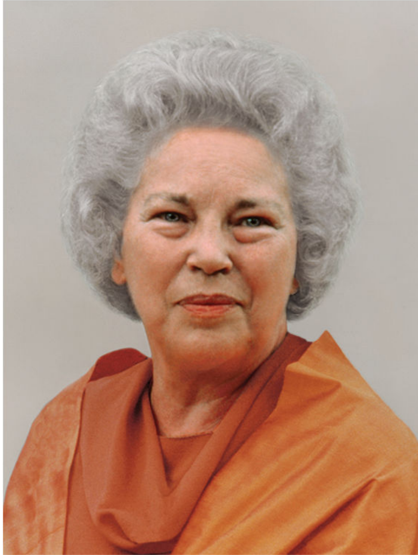
SRI DAYA MATA (1914–2010)

Third president and spiritual head of Self-Realization Fellowship/ Yogoda Satsanga Society of India