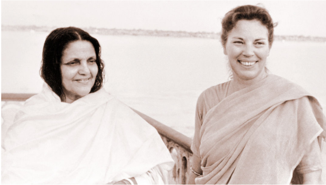
With Ananda Moyi Ma, the “Bliss-permeated Mother,” at the latter’s ashram on the Ganges at Banaras, 1959