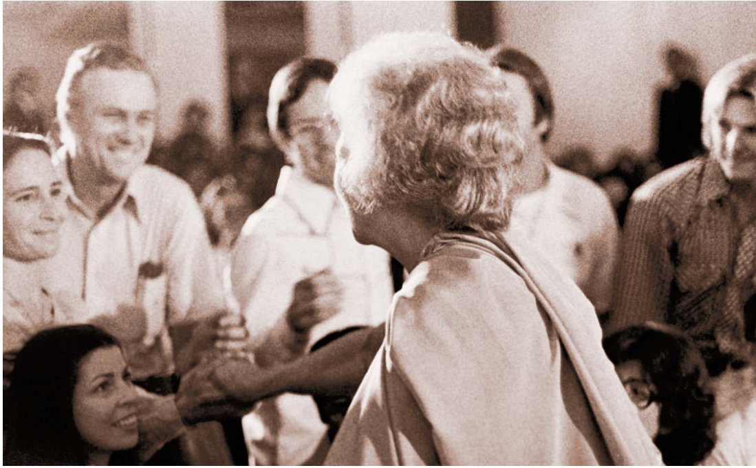
Greeting participants at Convocation, Biltmore Hotel, Los Angeles, 1978