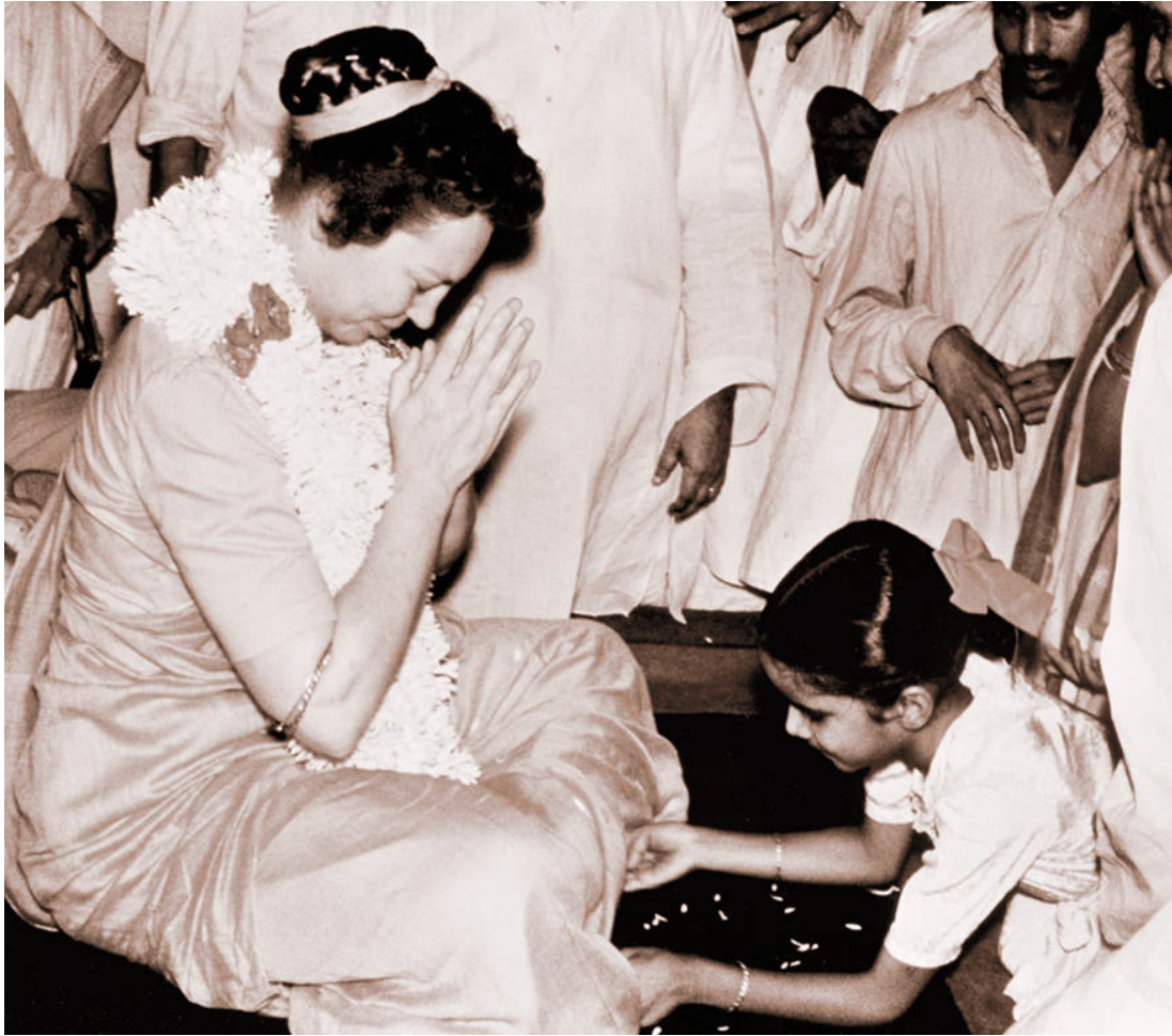
Calcutta, July 1961. Mataji greets little girl with ancient Indian gesture, pranam , which signifies “my soul bows to your soul.”