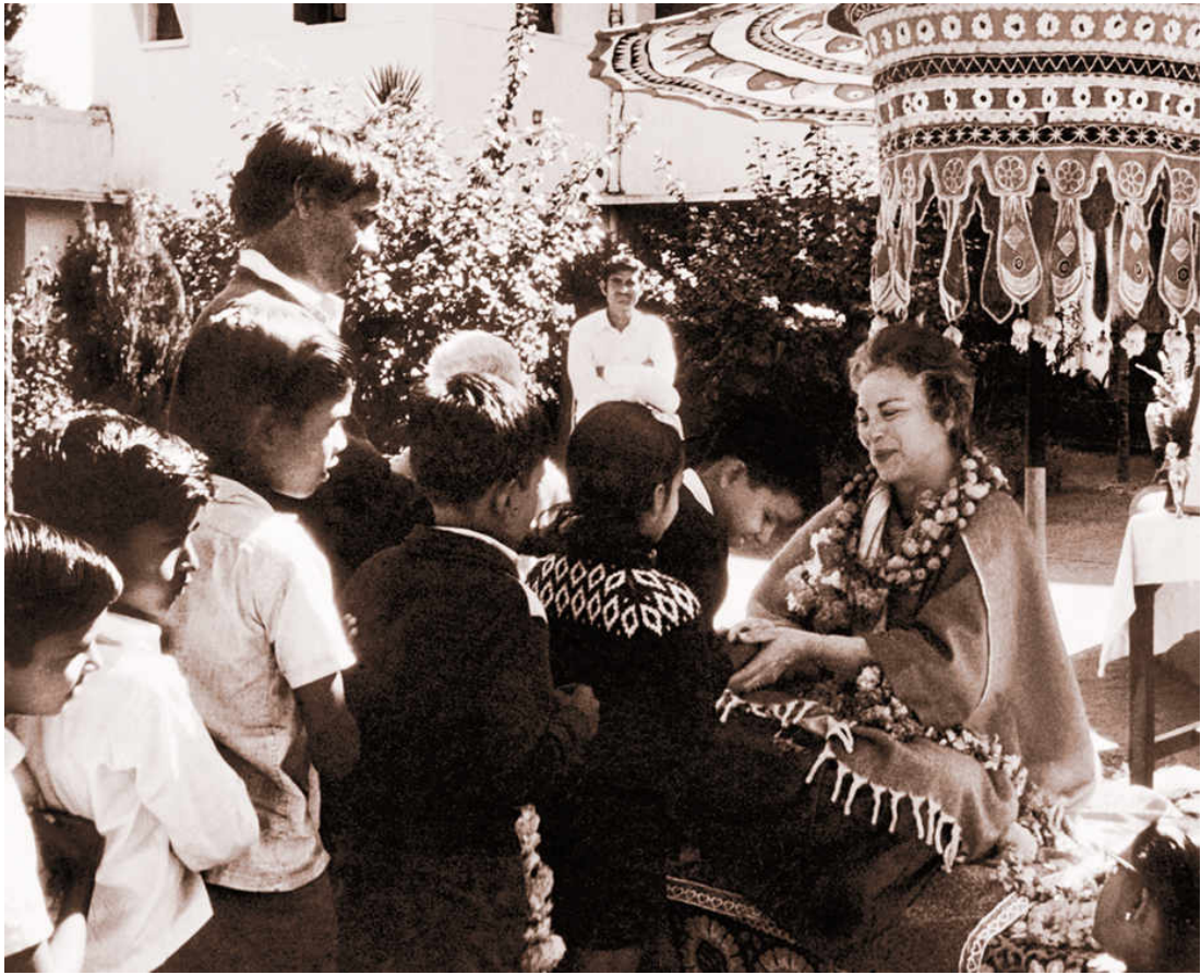
Greeting students at YSS school for boys, Ranchi, 1972