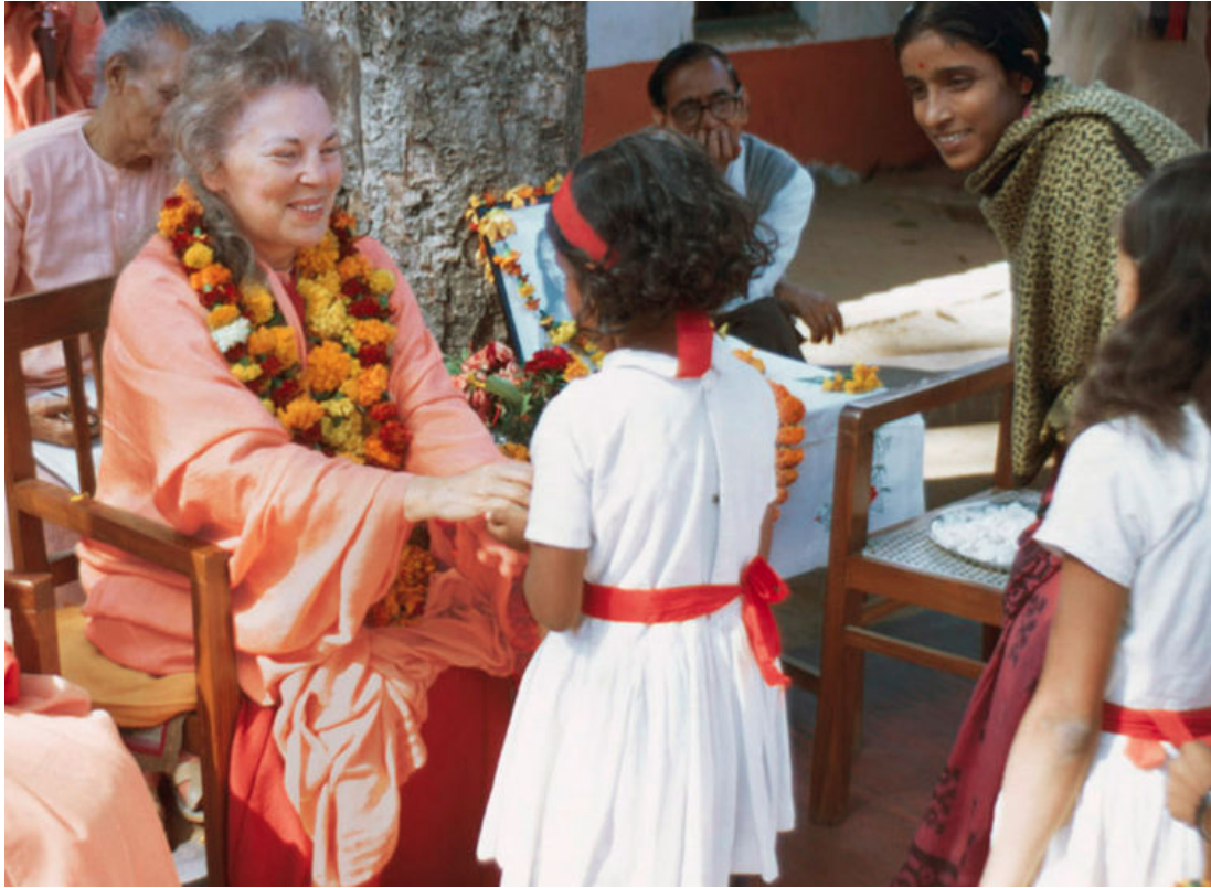
At Yogoda Satsanga school for girls, Ranchi, 1972