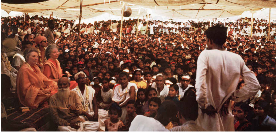
In the village of Palpara, West Bengal, 1973

“The time comes when your consciousness remains unbrokenly in the meditative state — always with God....Eventually, you will find that even while you are doing your work, whenever you take your mind within for a moment, you will feel an inner effervescent well of devotion, of joy, of wisdom. You will say, ‘Ah, He is with me!’ This is the fruit of meditation that can be enjoyed at any time, in quiet communion or in the midst of activity.”