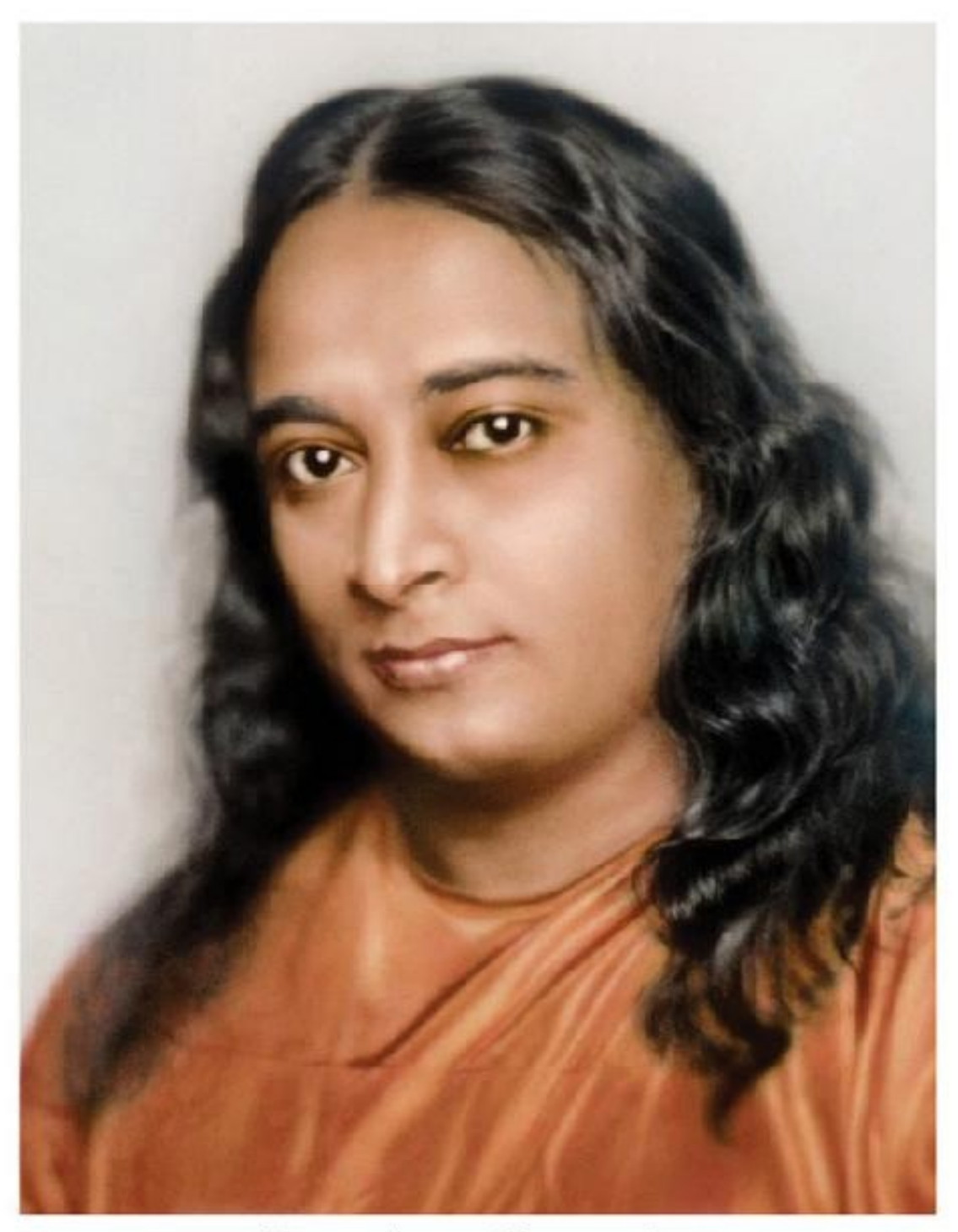
Paramahansa Yogananda (January 5, 1893 – March 7, 1952)