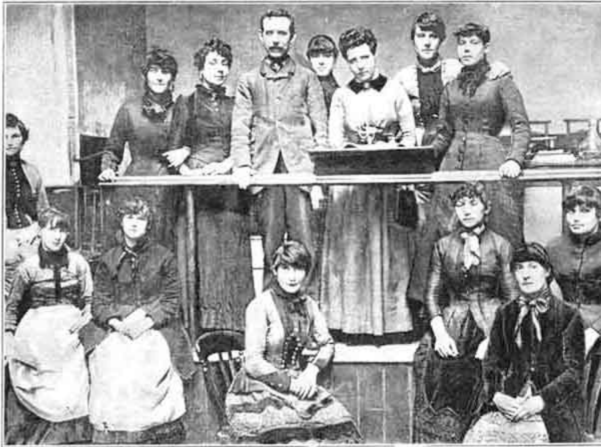
383. STRIKE COMMITTEE OF THE MATCHMAKERS' UNION.

384. The worst suffering of all was among the box-makers, thrown out of work by the strike, and they were hard to reach. Twopence-farthing per gross of boxes, and buy your own string and paste, is not wealth, but when the work went more rapid starvation came. Oh, those trudges through the lanes and alleys round Bethnal Green Junction late at night, when our day's work was over; children lying about on shavings, rags, anything; famine looking out of baby faces, out of women's eyes, out of the tremulous hands of men. Heart grew sick and eyes dim, and ever louder sounded the question, "Where is the cure for sorrow, what the way of rescue for the world?"