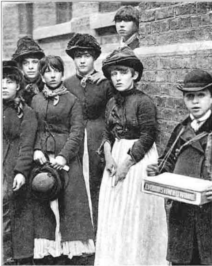
389. MEMBERS OF THE MATCHMAKERS' UNION.

390. Not only so; but since 1886 there had been slowly growing up a conviction that my philosophy was not sufficient; that life and mind were other than, more than, I had dreamed. Psychology was advancing with rapid strides; hypnotic experiments were revealing unlooked-for complexities in human consciousness, strange riddles of multiplex personalities, and, most startling of all, vivid intensities of mental action when the brain, that should be the generator of thought, was reduced to a comatose state. Fact after fact came hurtling in upon me, demanding explanation I was incompetent to give. I studied the obscurer sides of consciousness, dreams, hallucinations, illusions, insanity. Into the darkness shot a ray of light—