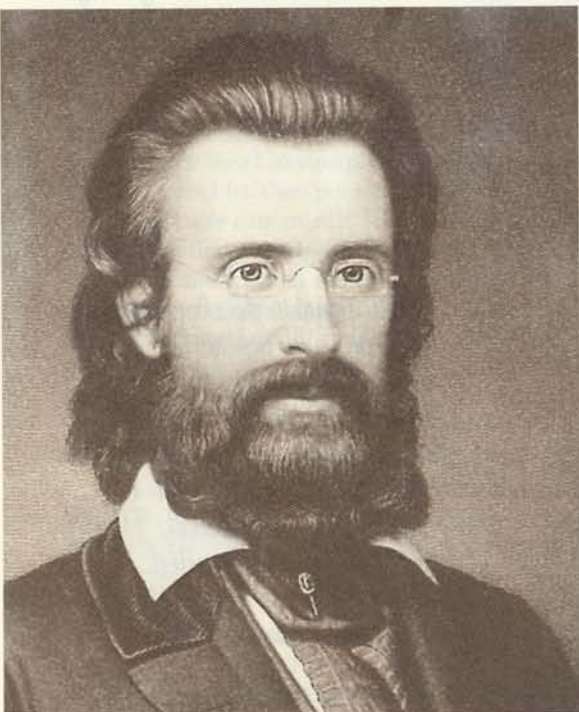
Andrew Jackson Davis in his early 30s, circa 1857.

The family moved to Hyde Park, where their hardscrabble existence continued, his father unemployed and his mother gravely ill. To help provide food for their scanty table, the boy peddled brewer's yeast door to door. One afternoon after a day of poor sales, he was glumly approaching his tenant home when suddenly a vision appeared before him of a beautiful mansion amid flourishing gardens. He heard his mother beckoning, "Come here, child; I want to show you my new house." The vision ended as he arrived home. Entering the house, he went to his mother's room and discovered she had died while he was making his rounds. His father and sister were in tears, but he felt no sadness. He was glad for his mother, because he was certain his vision had given him a glimpse of her new home.