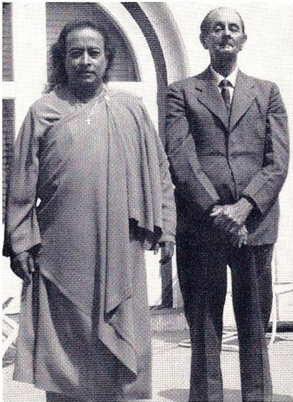
Paramahansa Yogananda and Dr. W. Y. Evans-Wentz, renowned Orientalist who wrote the foreword in Autobiography of a Yogi . Photo taken in 1949 at Self-Realization Fellowship Church, San Diego.